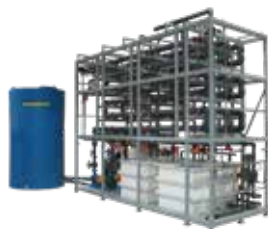
MEMKON Micro-Filtration Systems