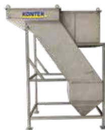
CLARIFIERS 304/316 SS MOC & Highest Plate Area Available