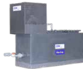
MAX-EVAP Atmospheric Evaporators