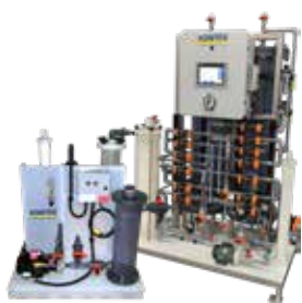
KC-20 & KC-400 Process Solution Purification Systems