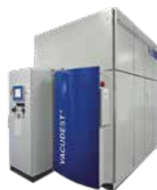
H2O VACUDEST Vacuum Distillation Evaporators