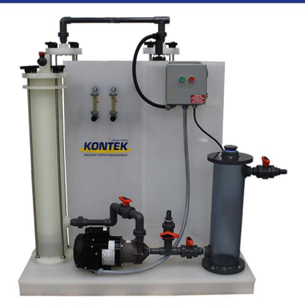
KC20-D (2/3 CU. FT.) DOUBLE COLUMN ION EXCHANGE Two resin columns for bath tank sizes up to 600 USG

KC20-S (1/3 CU. FT.) SINGLE COLUMN ION EXCHANGE One resin column for bath tank sizes up to 200 USG